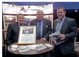
ACE pleased to support the CIU Clubs at the 2014 Conference and Exhibition

Re-upholstery and refurbishment work also carried out