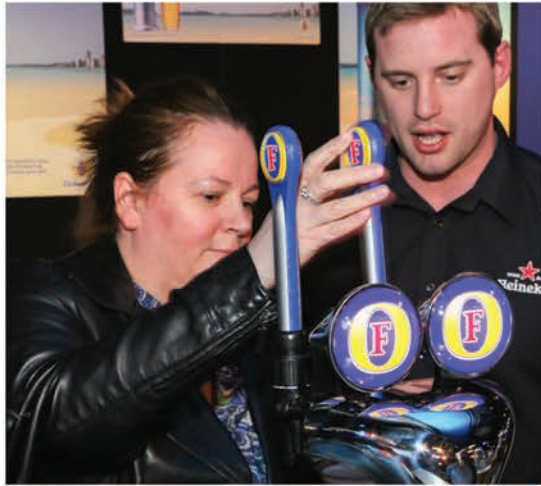
PERFECT: Delegates from clubs across the country tried their hand at delivering 'Best in Glass' quality

P int Perfection was the key message from HEINEKEN at the 23rd CIU Beer & Trades Exhibition in Blackpool where delegates from across the country were invited to try and achieve it for themselves.